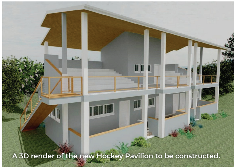
A 3D render of the new Hockey Pavilion to be constructed.

Other contributors include The National Sports Council (13% towards of the total cost of the Centre through a contribution to phase one), The International Hockey Federation (12% towards the total cost of the Centre for phase one; and The Tourism Development Corporation (TDC) which contributed to both phases, making a total contribution of 9% of the total cost to date. This represents a total investment of $1.124 million in field hockey in Barbados. ■