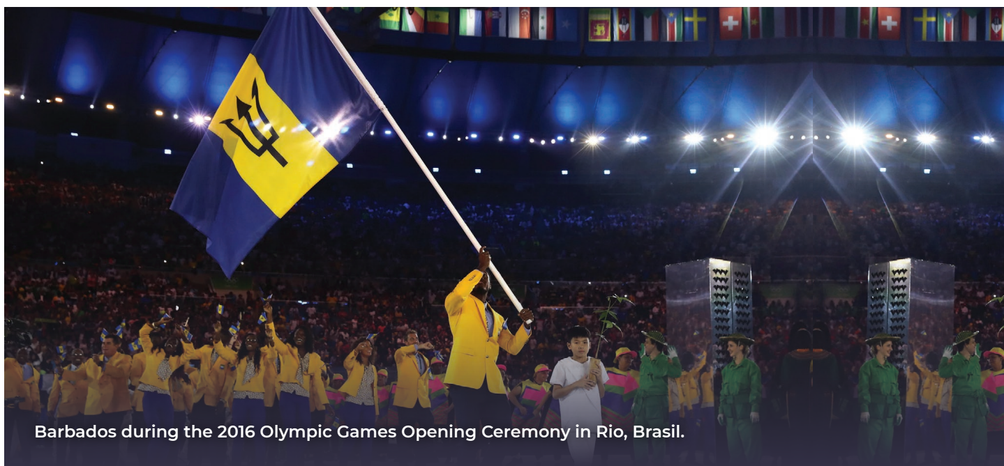
Barbados during the 2016 Olympic Games Opening Ceremony in Rio, Brasil.

The Barbados Olympic Association Inc. (BOA) joins the rest of the world in the count down to the Tokyo 2021 Olympics. For Barbados, the year 1968 would go down in history as being an important one for its sporting fraternity. It was the year that the country would make its debut at the Summer Olympics and coming just short of two years after attaining independence, it was an especially proud occasion for the island nation.