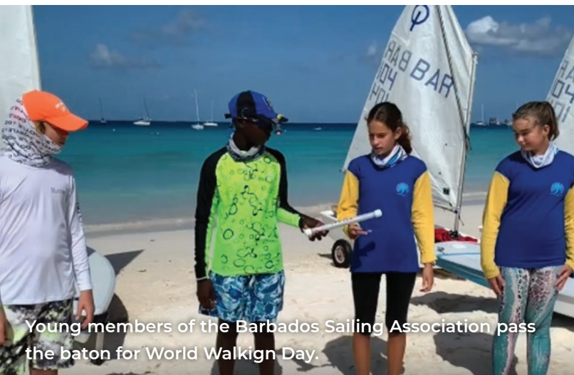
Young members of the Barbados Sailing Association pass the baton for World Walkign Day.

The Barbados Olympic Association Inc. (BOA) was proud to join in the Tafisa global event and to encourage local national federations to participate. Several organizations passed the baton across all time zones from east to west to celebrate the power of sport and physical activity in unifying the world during the COVID-19 crisis.