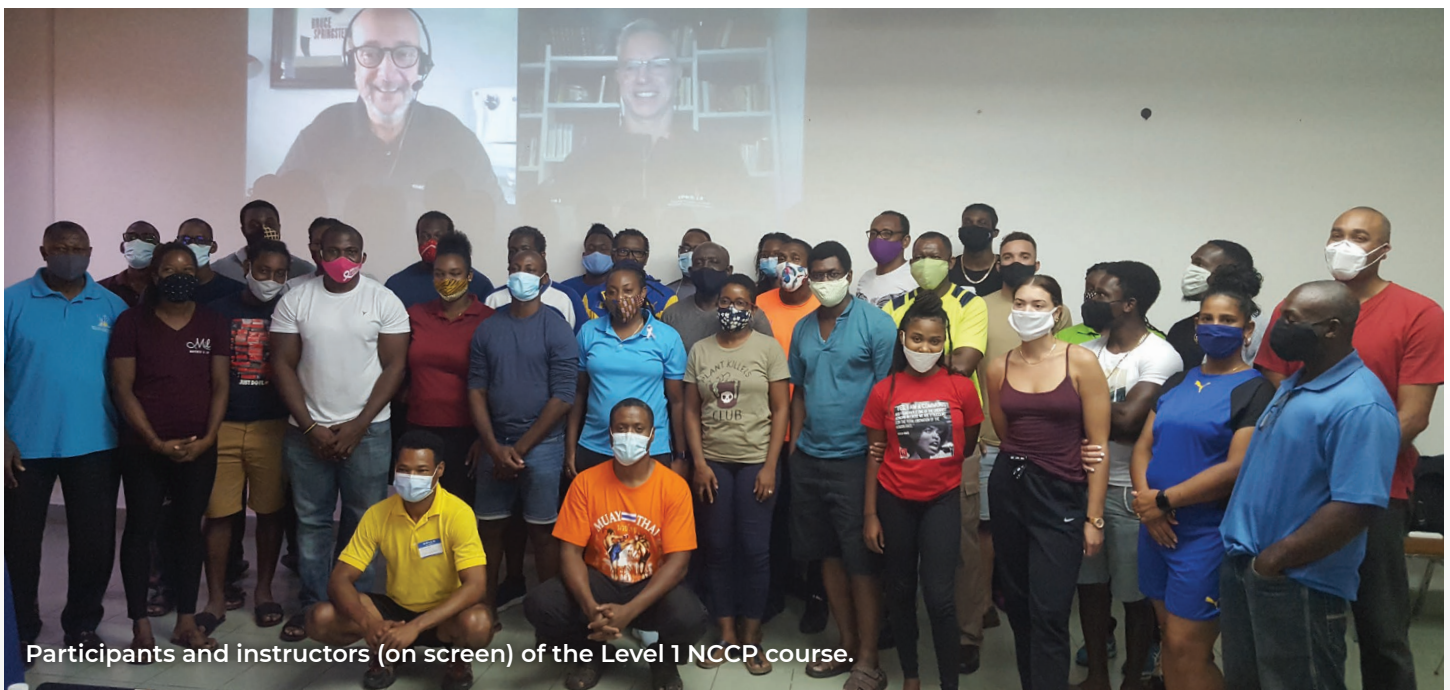
Participants and instructors (on screen) of the Level 1 NCCP course.

The Barbados Olympic Association Inc. (BOA) continued to achieve the goals set out in its strategic plan with the recent training of thirty coaches in Level 1 of the Canada-based National Coaching Certification Programme (NCCP).