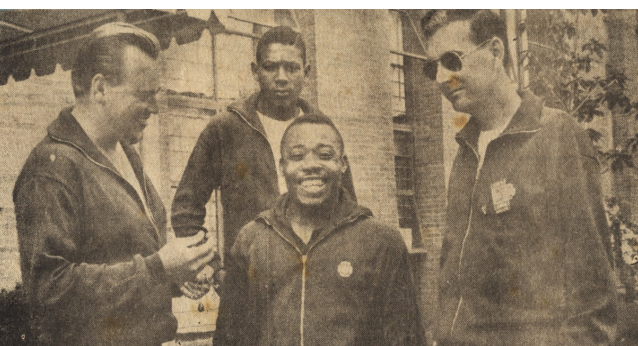
Members of the 1968 Barbados Olympic delegation.

From then until now, Barbados has shown consistent determination in its participation in the games, gaining its first and only medal thus far, in the 2000 Olympic Games held in Sydney, Australia. It was won by Obadele Thompson, who secured the bronze medal in the men's 100 meters and placed fourth in the men's 200 meters. Though medaling only once in the past five decades, this has not daunted our athletes resolve to represent their country, as they strive to be one of the three, in their chosen sport, to mount the podium for the medal ceremony. But throughout the years the athletes have set new national and personal records which have been celebrated by all across the 166 square miles that is Barbados.