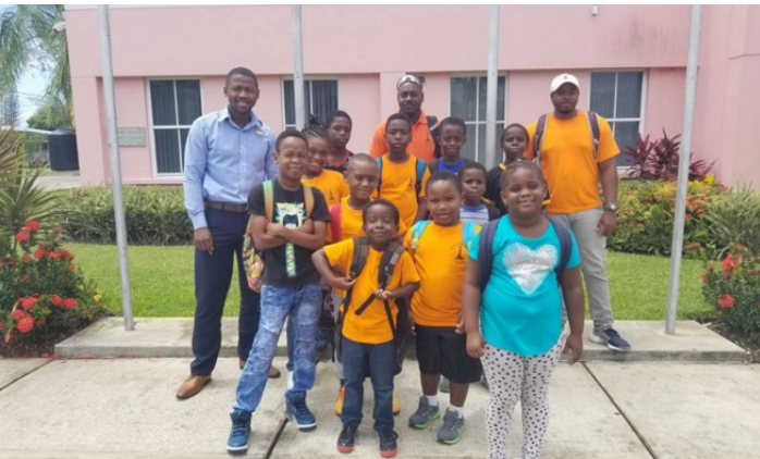
The Deacons Cricket Camp tour group.