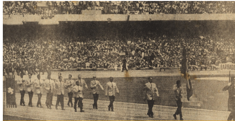
The Barbados Team at the 1968 Olympic Games Parade.