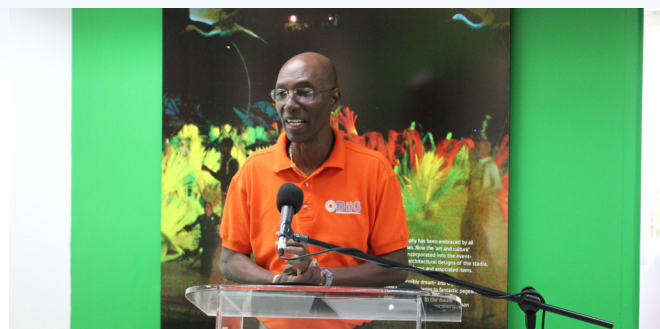
BOA Assistant Secretary General informs of the big changes to this years games.