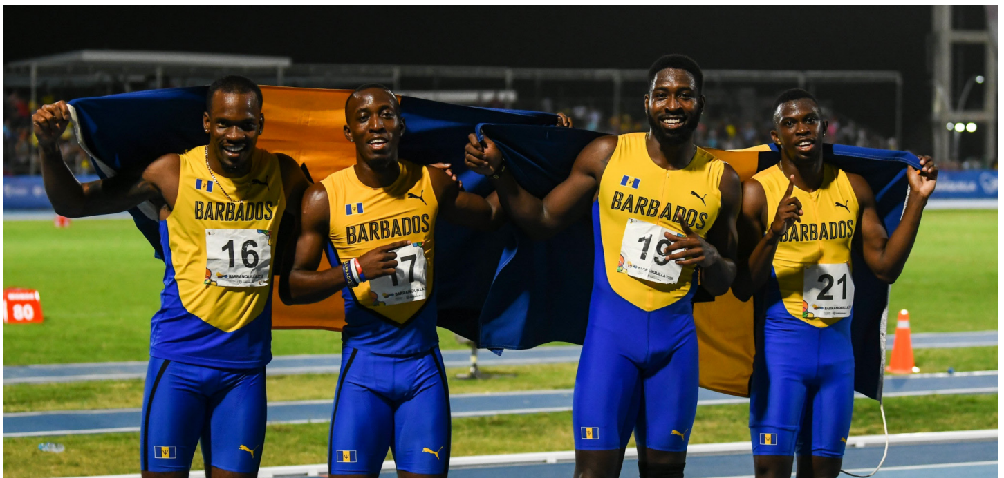
The Barbados men's 4x100 metres team after they struck gold.

Barbados is looking to improve on the achievements at this 2018 edition of the CAC as we look towards the next edition in 2022 scheduled to take place in Panama.