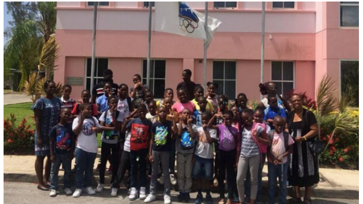
The Calvary Moravian Church Bible Camp tour group.