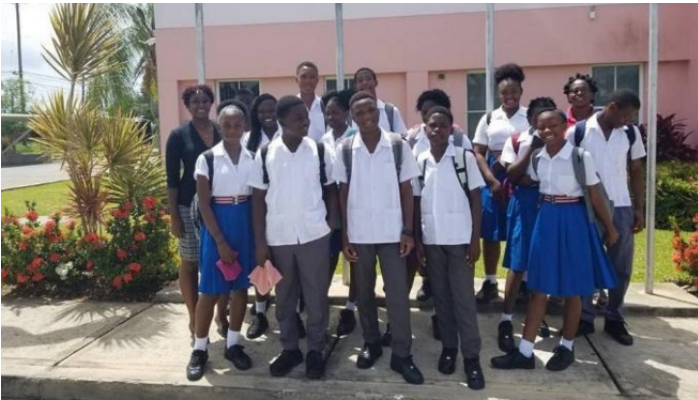
Deighton Griffith Secondary School museum tour group.