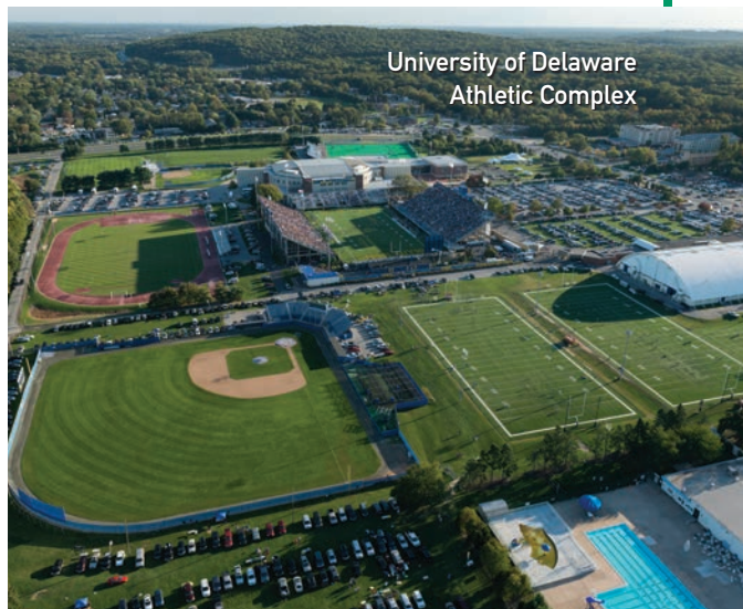
University of Delaware Athletic Complex

Visit www.udel.edu to learn more about the University.