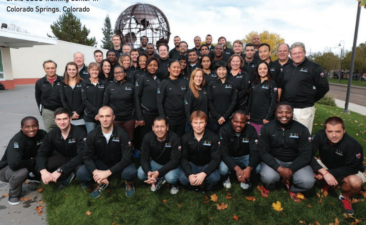
Eighth-year ICECP participants at the USOC Training Center in Colorado Springs, Colorado

"This is a very high classed coaching course taking into consideration its content and intensity, great idea to keep, there should be a follow up of past participants after they pass through this program for an international network. There should be a physical exercise by all coaches as a group twice a week, a proper tour of the gym because some of us saw certain machines for the first time. Thanks for all the great work!"