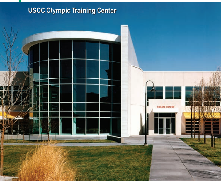
USOC Olympic Training Center

ICECP program participants will be housed at the US Olympic Training Center in Colorado Springs and gain an in-depth understanding of the workings of the USOC's Olympic Training Center and athlete support programs through the performance services division. Additionally, the courses taught in Colorado Springs will be conducted by USOC staff and experts.