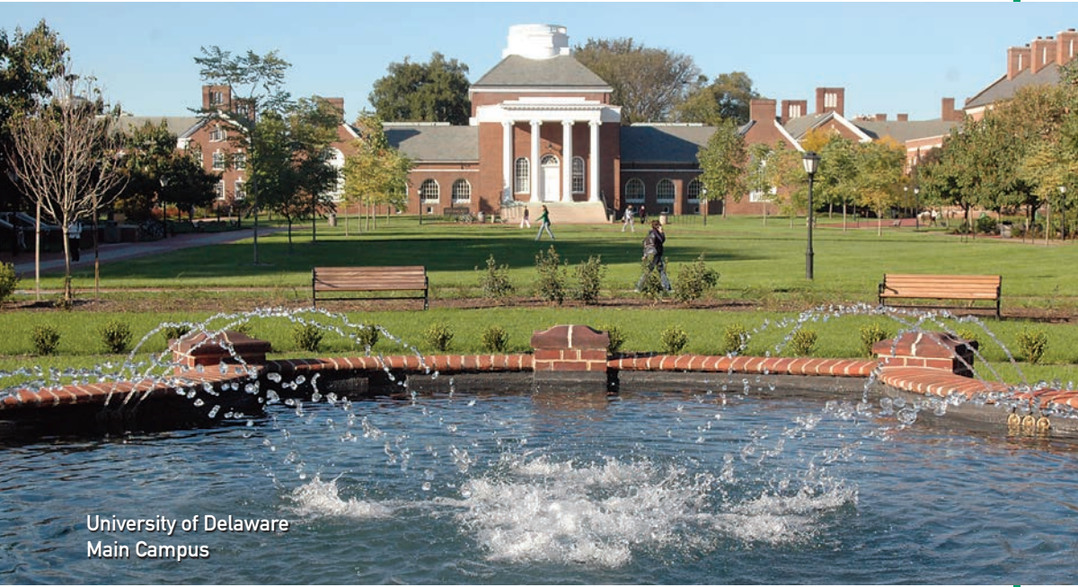
University of Delaware Main Campus

THE UNIVERSITY OF DELAWARE has grown from its founding as a small private academy in 1743 to a major university. The University offers an impressive collection of educational resources. The 16,000 undergraduate students may choose to major in any one or more of over 100 academic majors. The University's distinguished faculty includes internationally known scientists, authors and teachers, who are committed to continuing the University of Delaware's tradition in providing one of the highest quality undergraduate educations available in the United States.